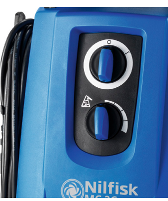
Automatic start/stop. Deactivation of the spray gun trigger, the motor stops. This saves energy and elimintes noise during work pauses.