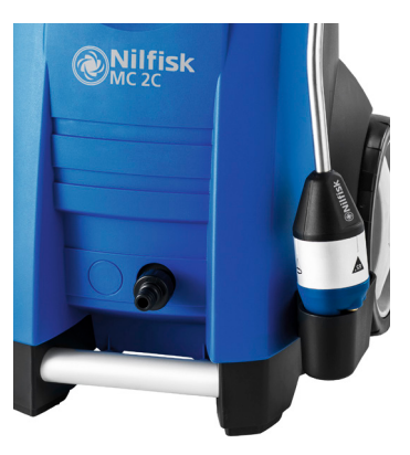
4-in-1- innovative lance and nozzlehead. One lance for most of your cleaning tasks.