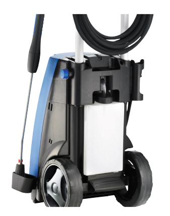
Removable and integrated detergent tank for easy transport and easy filling of detergent.