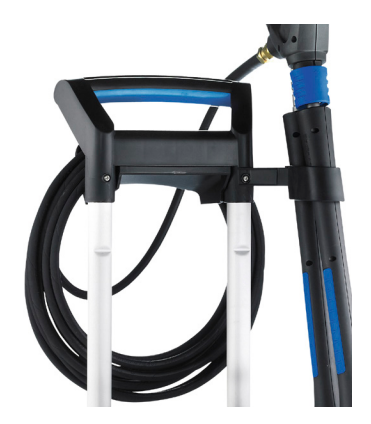
Together with the compact design, the machine takes up less storage space since the size of the aluminium telescopic handle can be reduced during storage.