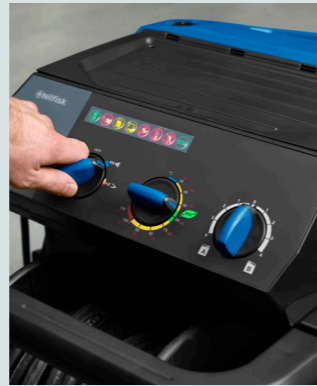
Control panel with safety indications.