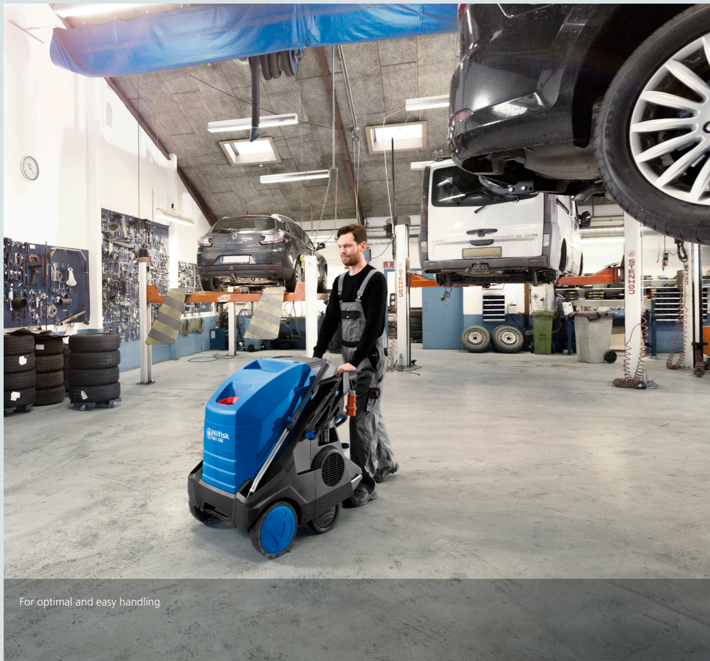
For optimal and easy handling

The 4 wheel concept with larger wheel diameter and sweight balance mean that the MH 3M and 4M models provide optimal manoeuvrability over all types of surface – reducing the effort needed by the user to reach their cleaning site.