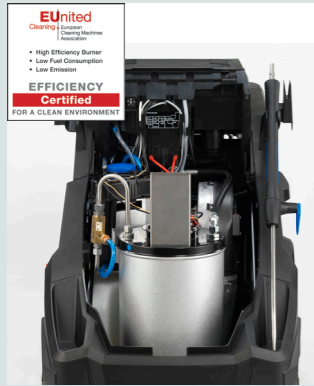
The EcoPower boiler provides high efficiency and low fuel consumption – approved by EUnited.