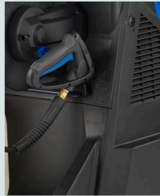
Unique holder prevents spray gun from falling on the ground when the washer is used or moved.

The 4 wheel concept with larger wheel diameter and sweight balance mean that the MH 3M and 4M models provide optimal manoeuvrability over all types of surface – reducing the effort needed by the user to reach their cleaning site.