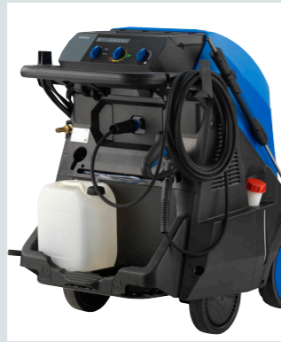
All key functions placed for optimal ease-of-use.