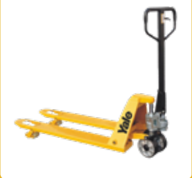
PLHP15 Low Profile