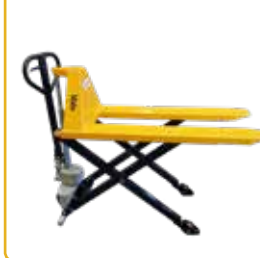
PLHP10 Manual Scissor Lift