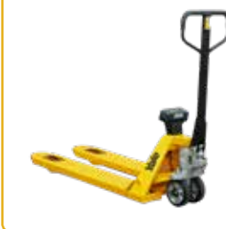
1100/1200 Weigh scale