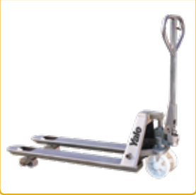
PLHP20 Stainless Steel